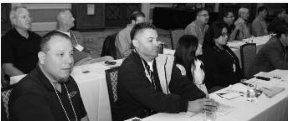
UFCW Local 1167 representatives at the Food and Drug Council convention

The convention closed with field reports from FDC affiliates who spoke about, among other topics, the struggle for grocery contracts in Southern California in 2011 and the continuing negotiations with grocers in Northern California.