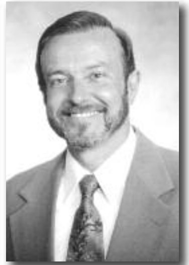
By Bill Lathrop

We don't have a crystal ball in the headquarters of UFCW Local 1167, but we follow the news and have an understanding of the American political calendar. We can also make educated guesses about the months ahead based on current trends in labor issues and society in general.