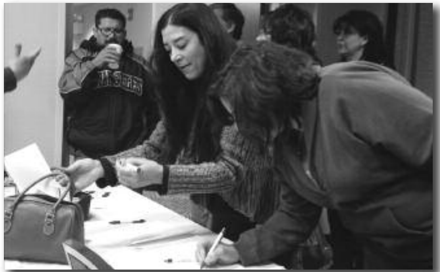
Food 4 Less members registered before voting to reject an earlier set of proposals from the employer in December. Union leaders recommended approval of an agreement that was reached at the end of the month.

"Our members at Ralphs stuck together and ended up with a contract that shows them respect. We were determined to do the same with Food 4 Less, and we succeeded."