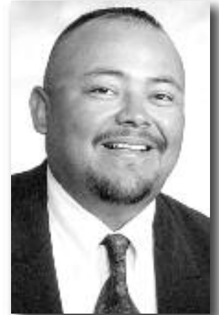
By Jerry Espinosa

The key is to start preparing now for your hard-earned vacation.