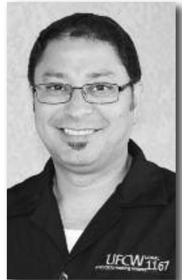
By Jose Correa

Even something like popping a grape in your mouth — a practice called grazing — could cost you your job.