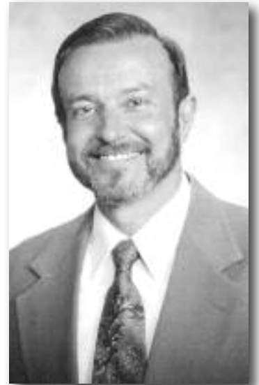
By Bill Lathrop

Obama mustn't be blamed for the troubles that currently plague our nation — joblessness, deficits, environmental catastrophes, etc.